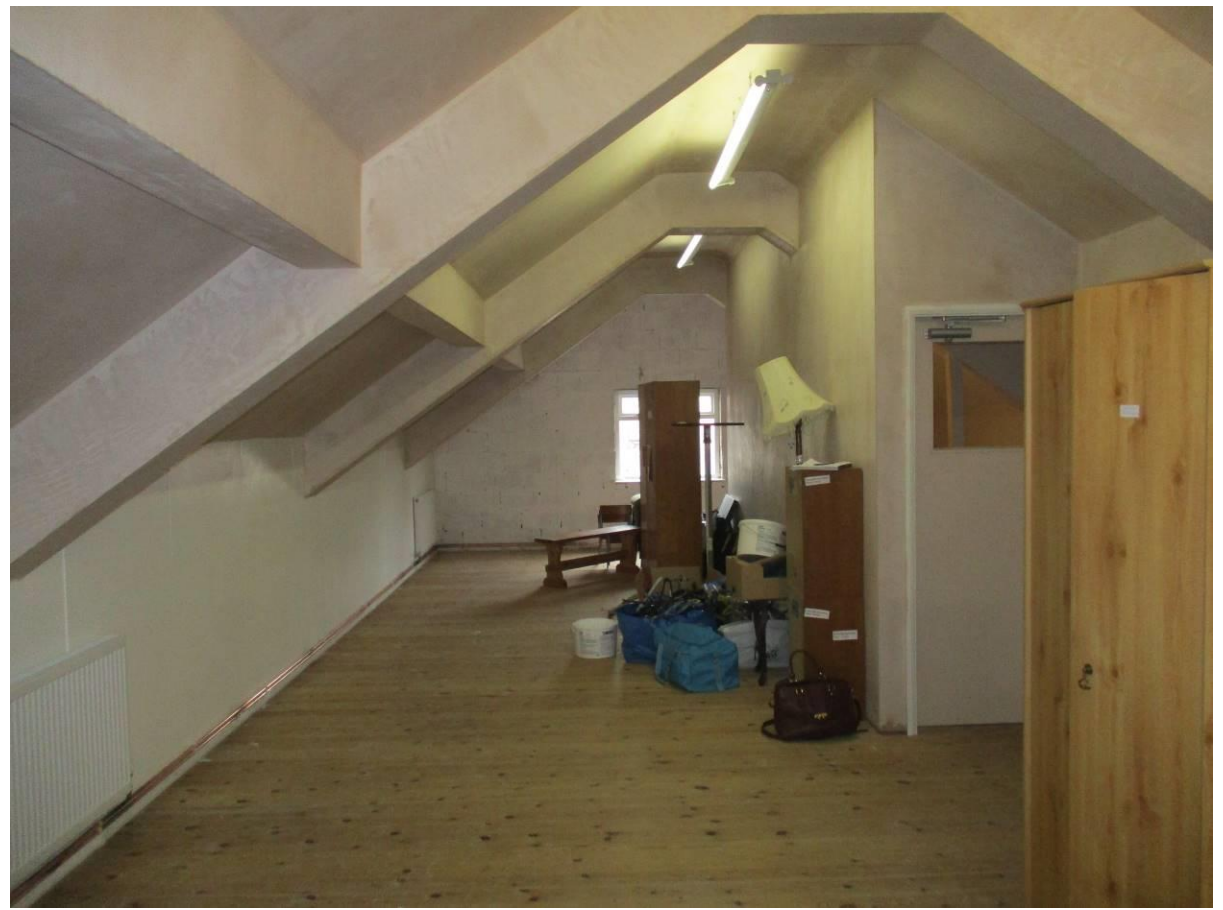
Figure 2: Loft space due to be converted into a meeting room with storage facilities.